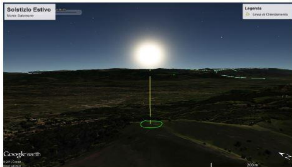
Fig. 2 – Three-dimensional model of the hill of Mount Solomon, in relation to the orientation of the pointed summit, in the morning (dawn) of the summer solstice.

the Sun was calculated, along the azimuth indicated by the pointed top.