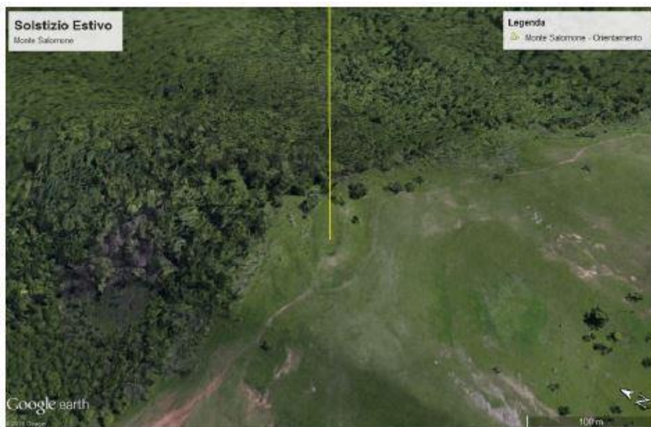
Fig. 3 – Three-dimensional model of the hill of Mount Solomon, in relation to the orientation of the pointed summit, in the morning (dawn) of the summer solstice.

many other modeled hills. from the hand of man, shaped in times when according to official science, there could not have been civilizations with astronomical knowledge of this type, and not before the ancient Roman era (Italic peoples of central Italy).