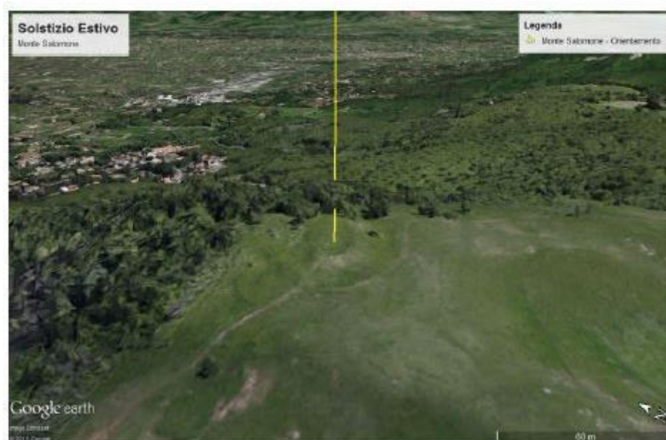
Fig. 4 – Three-dimensional model of the hill of Mount Solomon, in relation to the orientation of the pointed summit, in the morning (dawn) of the summer solstice.

to the Mother Goddess [5], as the top of the mountain was characterized not only by a vaginal-shaped depression, but above all by two concentric belts that had to symbolize the small and the labia majora of the female genital organ, now partly incorporated in the vegetation. All this was very obvious.